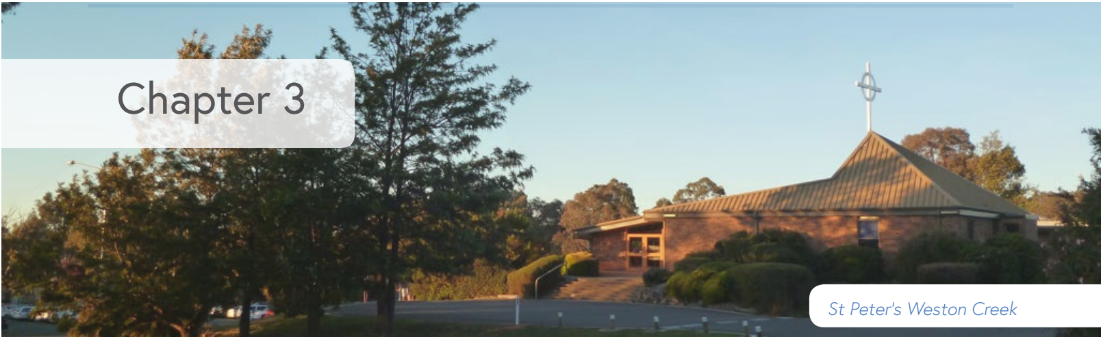
St Peter's Weston Creek