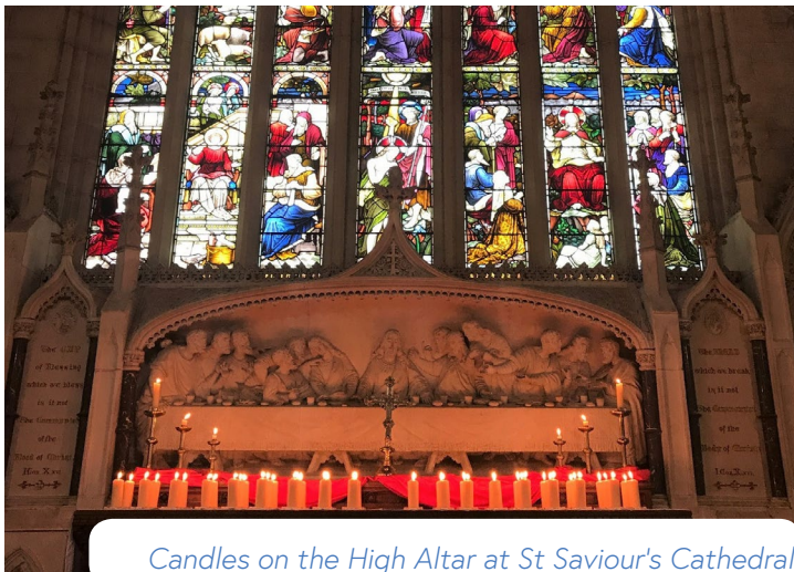
Candles on the High Altar at St Saviour's Cathedral

At a Diocesan level a moving Service of Remembrance and Thanksgiving was held in our Cathedral on Saturday 13th October 2018, jointly organised by the Friends of the Cathedral and the Anglican Historical Society, to give thanks to God for the 920 men from this then rural Diocese who made the ultimate sacrifice in what is commonly known as the 'Great War'.