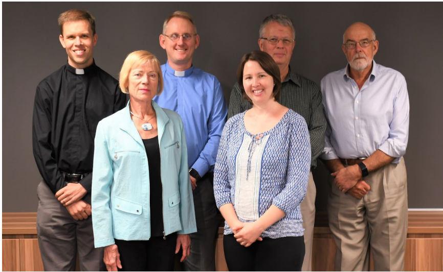
EENC from left to right:

General feedback on the conduct of the Electoral Synod was overwhelmingly positive. The EENC has provided a report to this Synod reflecting on the Episcopal Election process. A presentation on this will be provided at Synod.